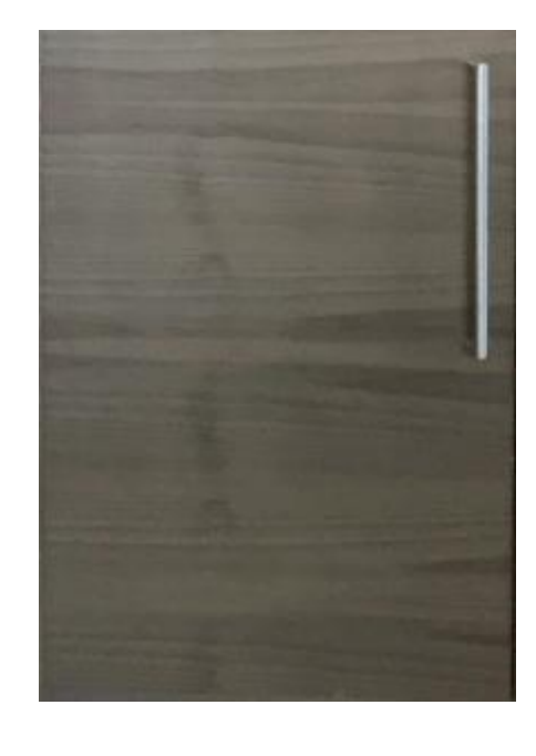
Cabinet Style: PRINCETON Color: SLATE