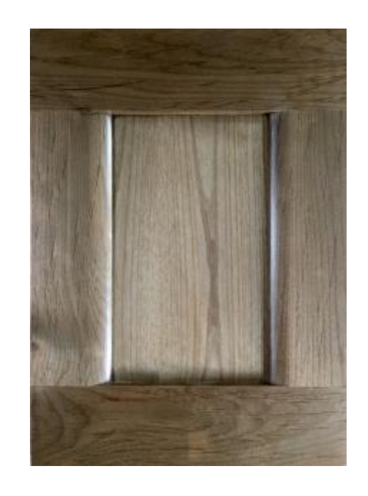
Cabinet Style: ATLAS Color: SUMMIT Wood Species: ALDER