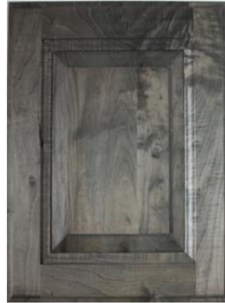
Style: APEX Color: RIVERROCK Wood Species: MAPLE