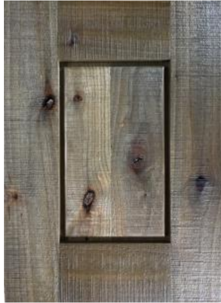
Cabinet Style: SUMMIT Color: OLD SILVER Wood Species: KNOTTY ALDER