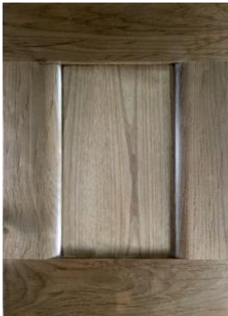
Cabinet Style: ATLAS Color: OLD SILVER Wood Species: ALDER