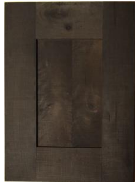
Cabinet Style: CASCADE Color: BARK Wood Species: Rip Sawn, CHERRY