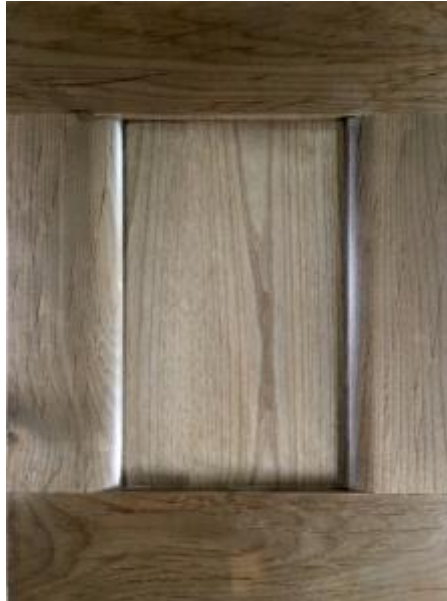
Cabinet Style: SUMMIT Color: OLD SILVER Wood Species: KNOTTY ALDER