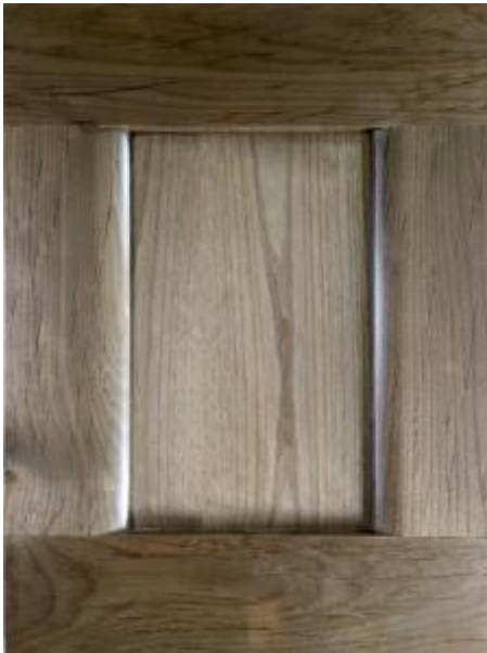
Cabinet Style: CASCADE Color: GUNMETAL Wood Species: Quarter Sawn, WHITE OAK