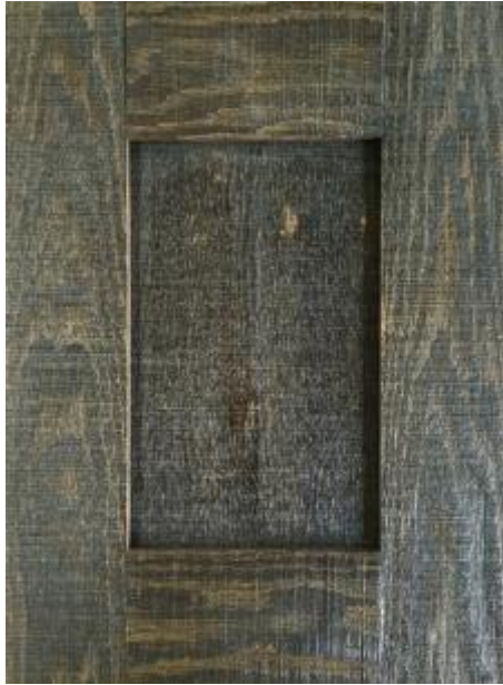
Cabinet Style: CASCADE Color: GUNMETAL Wood Species: Quarter Sawn, WHITE OAK